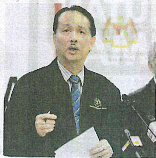
Dr Noor Hisham pada sidang akhbar harian berkaitan jangkitan Covid-19 di Kementerian Kesihatan, Putrajaya semalam.

"Seperti yang dimaklumkan pada 2 Mei lalu, KKM mengenal pasti satu kluster melibatkan pekerja di sebuah kilang di Pedas, Negeri Sembilan.