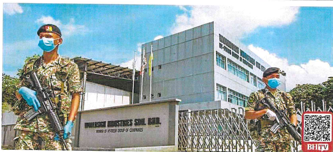
Anggota tentera membuat kawalan di sebuah kilang di Pedas, Negeri Sembilan susulan terdapat 60 kes positif COVID-19.

"Ini bermakna, kes penularan tempatan adalah sebanyak 64 kes, di mana sebanyak tiga kes telah dikesan dari kluster dan lokaliti di bawah Perintah Kawalan Pergerakan Diperketatkan (PKPD)," katanya pada sidang media harian COVID-19, di sini, semalam.