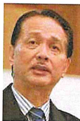
Datuk Dr Noor Hisham Abdullah

The death toll remained at 107 or 1.64 per cent from the total cases, as no death was recorded yesterday by the National Crisis Preparedness and Response Centre up to noon.